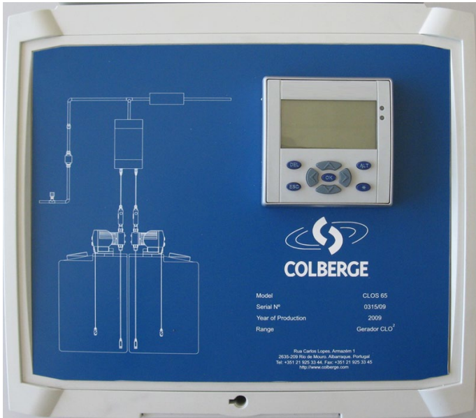
Chlorine dioxide generator synoptic